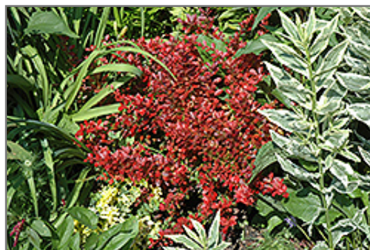
Cherry Bomb Japanese Barberry