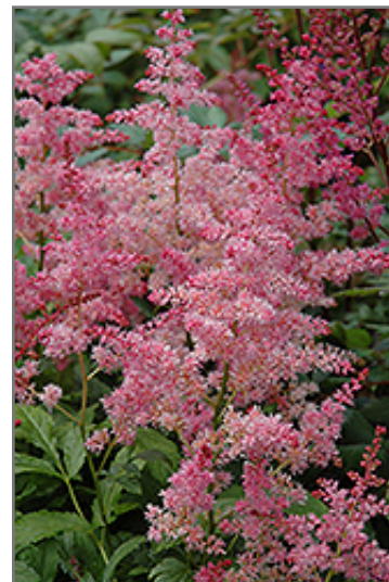
Jump and Jive Astilbe flowers