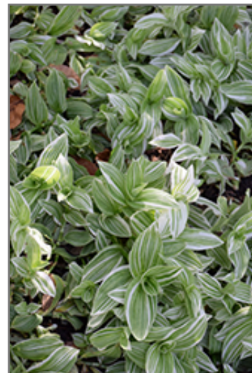
Sanna Spiderwort foliage

This beautiful variety features striking green and white variegated leaves; its trailing form works well with hanging baskets, or cascading from garden walls; grown primarily for foliage; a great, easy care indoor plant as well