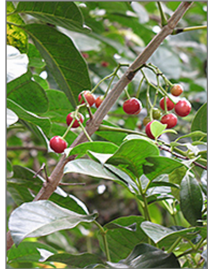
Puriri fruit

This tree does best in full sun to partial shade. It does best in average to evenly moist conditions, but will not tolerate standing water. It may require supplemental watering during periods of drought or extended heat. This plant should not require much in the way of fertilizing once established, although it may appreciate a shot of general-purpose fertilizer from time to time early in the growing season. It is not particular as to soil type or pH, and is able to handle environmental salt. It is highly tolerant of urban pollution and will even thrive in inner city environments, and will benefit from being planted in a relatively sheltered location. This species is not originally from North America.