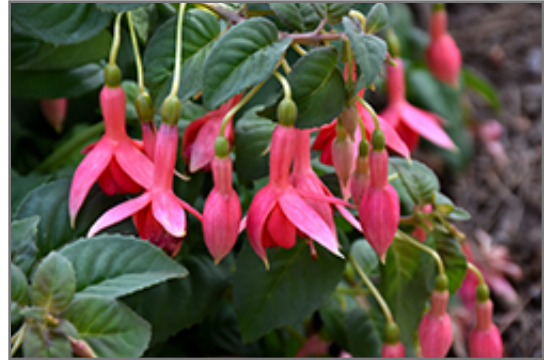
Coachman Fuchsia flowers

A beautiful upright selection, ideal for patio pots, baskets, and window boxes; stunning flowers with red corollas and salmon sepals dangle from arching branches, blooming from spring to fall; adaptable as a houseplant; low maintenance