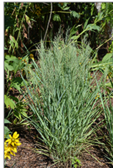
Gunsmoke Switch Grass