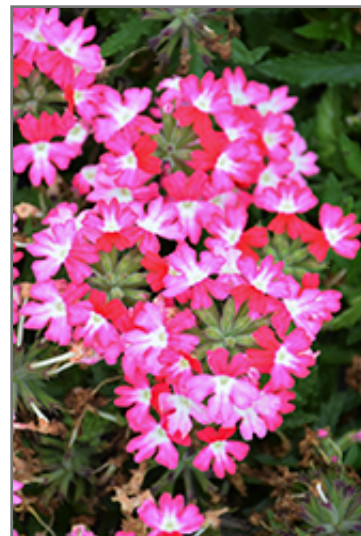
Hurricane Hot Pink Verbena flowers

Hurricane Hot Pink Verbena is recommended for the following landscape applications;