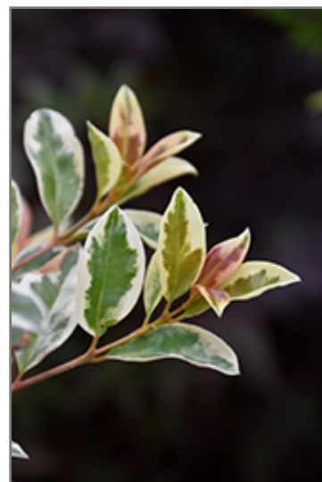
Lemon Swirl Variegated Brush Cherry foliage