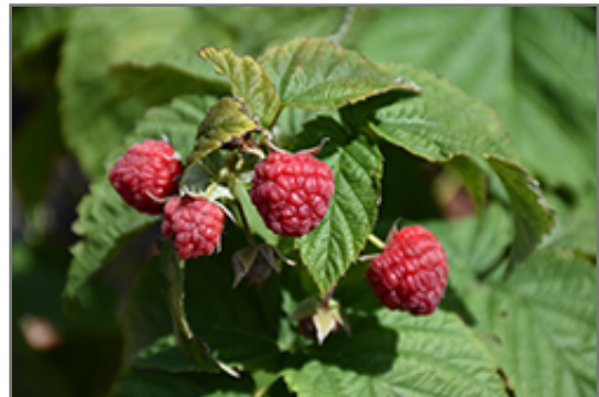
Autumn Britten Raspberry fruit

Autumn Britten Raspberry has rich green deciduous foliage on a plant with an upright spreading habit of growth. The fuzzy oval compound leaves do not develop any appreciable fall color. It features an abundance of magnificent red berries in mid summer.