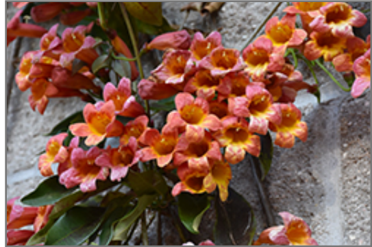
Tangerine Beauty Cross Vine flowers

This woody vine does best in full sun to partial shade. It is very adaptable to both dry and moist growing conditions, but will not tolerate any standing water. It may require supplemental watering during periods of drought or extended heat. It is not particular as to soil type, but has a definite preference for acidic soils. It is highly tolerant of urban pollution and will even thrive in inner city environments. This is a selection of a native North American species.