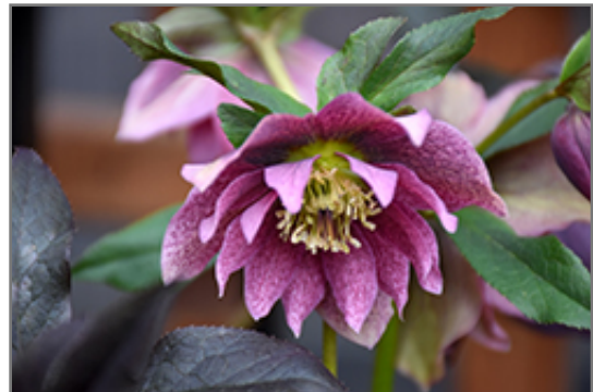
Spring Princess Hellebore flowers