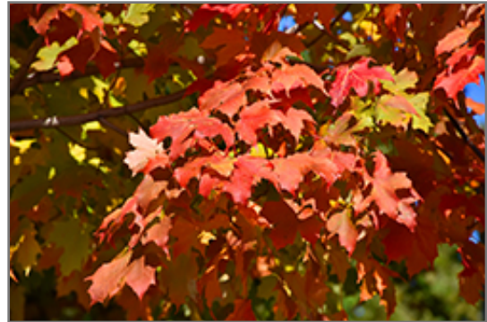
Autumn Splendor Sugar Maple in fall