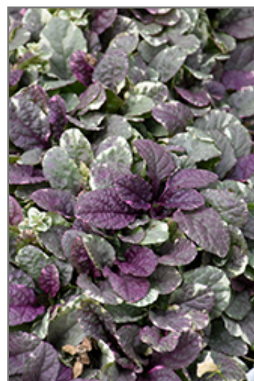
Burgundy Glow Bugleweed foliage