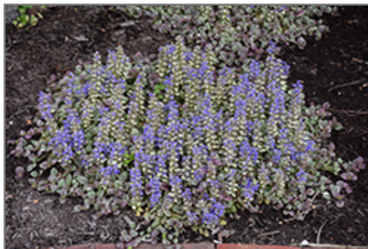
Burgundy Glow Bugleweed in bloom