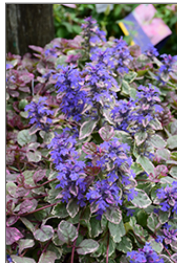
Burgundy Glow Bugleweed flowers

Burgundy Glow Bugleweed is a dense herbaceous evergreen perennial with a ground-hugging habit of growth. Its medium texture blends into the garden, but can always be balanced by a couple of finer or coarser plants for an effective composition.