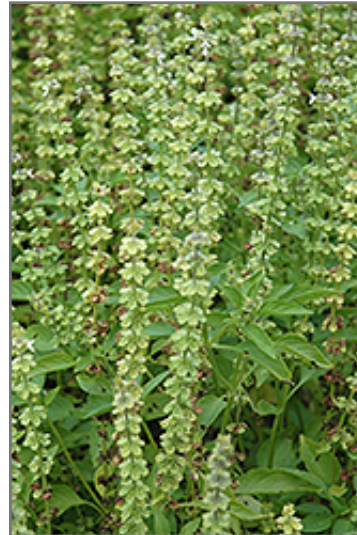
Sweet Dani Basil flowers