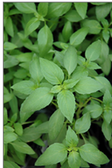
Sweet Dani Basil foliage

Sweet Dani Basil will grow to be about 18 inches tall at maturity extending to 24 inches tall with the flowers, with a spread of 12 inches. When grown in masses or used as a bedding plant, individual plants should be spaced approximately 10 inches apart. This fast-growing annual will normally live for one full growing season, needing replacement the following year.