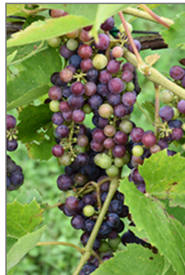
St. Croix Grape fruit

St. Croix Grape has rich green deciduous foliage on a plant with a spreading habit of growth. The lobed leaves turn yellow in fall. It produces small clusters of deep purple grapes with powder blue overtones in mid fall.