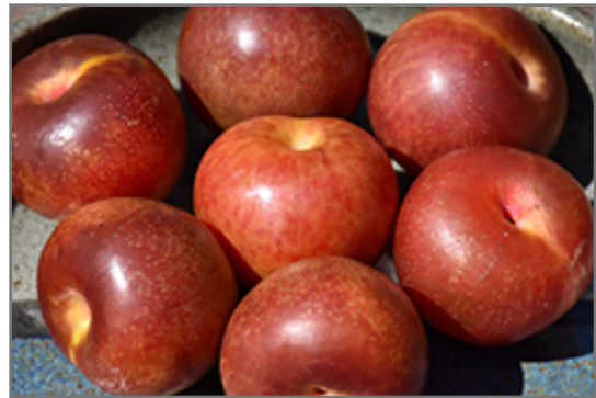
Burbank Plum fruit

This is a deciduous tree with a more or less rounded form. Its average texture blends into the landscape, but can be balanced by one or two finer or coarser trees or shrubs for an effective composition. This plant will require occasional maintenance and upkeep, and is best pruned in late winter once the threat of extreme cold has passed. Gardeners should be aware of the following characteristic(s) that may warrant special consideration;