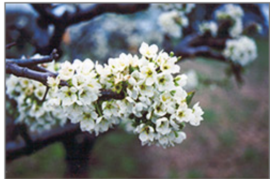
Burbank Plum flowers