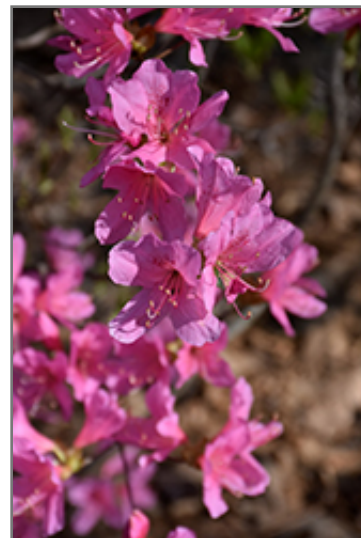
Netted Azalea flowers