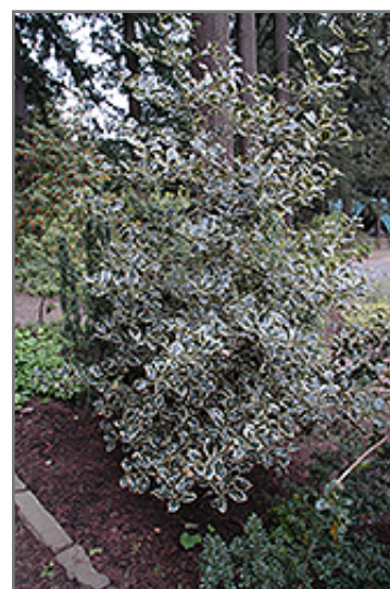
Oregon Select Variegated Holly