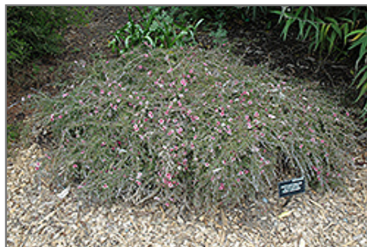
Pink Cascade Tea-Tree in bloom