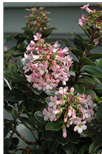
Pink Princess Escallonia flowers

Pink Princess Escallonia is recommended for the following landscape applications;