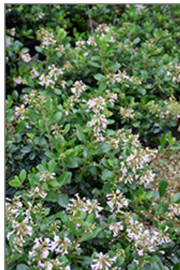
Pink Princess Escallonia in bloom