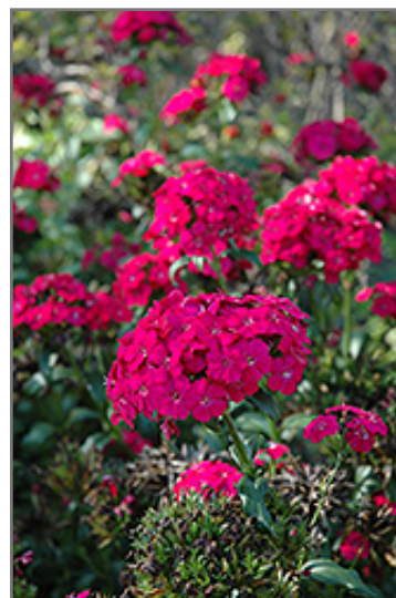
Amazon Neon Cherry Pinks flowers

Amazon Neon Cherry Pinks is an herbaceous evergreen perennial with a mounded form. It brings an extremely fine and delicate texture to the garden composition and should be used to full effect.