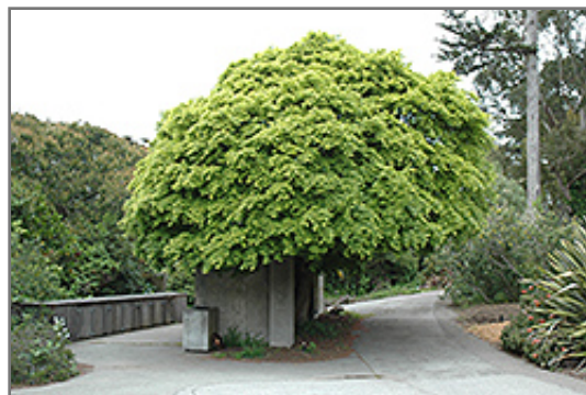
Momiji Japanese Maple