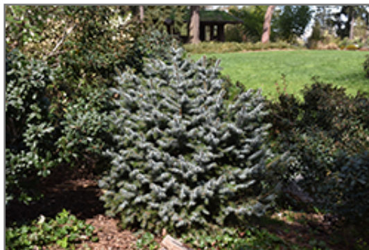
Papoose Dwarf Sitka Spruce

Papoose Dwarf Sitka Spruce is recommended for the following landscape applications;