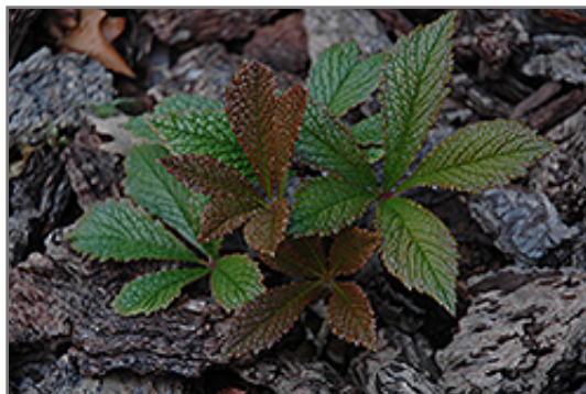
Firecracker Rodgersia in spring