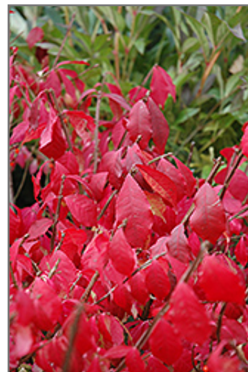
Burning Bush (tree form) in fall