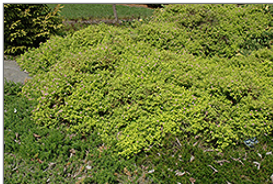
Golden Elf Spirea

Golden Elf Spirea is recommended for the following landscape applications;