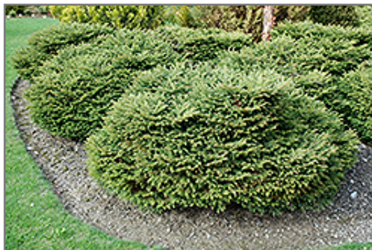
Creeping Norway Spruce