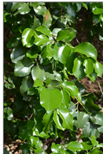
Catalina Cherry foliage

Catalina Cherry is recommended for the following landscape applications;