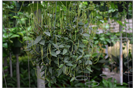
Funky Frog Peperomia in full

When grown indoors, Funky Frog Peperomia can be expected to grow to be about 12 inches tall at maturity, with a spread of 18 inches. It grows at a medium rate, and under ideal conditions can be expected to live for approximately 5 years. This houseplant performs well in both bright or indirect sunlight and strong artificial light, and can therefore be situated in almost any well-lit room or location. It does best in average to evenly moist soil, but will not tolerate standing water. The surface of the soil shouldn't be allowed to dry out completely, and so you should expect to water this plant once and possibly even twice each week. Be aware that your particular watering schedule may vary depending on its location in the room, the pot size, plant size and other conditions; if in doubt, ask one of our experts in the store for advice. It will benefit from a regular feeding with a general-purpose fertilizer with every second or third watering. It is not particular as to soil pH, but grows best in rich soil. Contact the store for specific recommendations on pre-mixed potting soil for this plant.