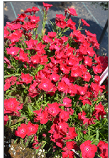
Beauties Tyra Pinks flowers