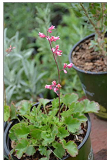
Jack O' the Rocks in bloom