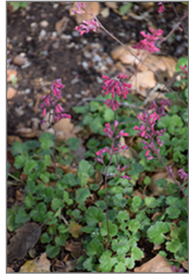
Canyon Pink Coral Bells in bloom

Canyon Pink Coral Bells is recommended for the following landscape applications;