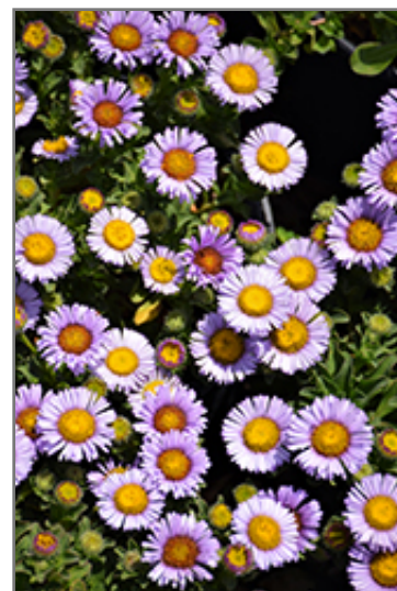
Cape Sebastian Seaside Daisy flowers

Cape Sebastian Seaside Daisy is recommended for the following landscape applications;