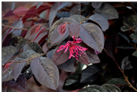
Carolina Midnight Chinese Fringeflower flowers

Carolina Midnight Chinese Fringeflower is recommended for the following landscape applications;