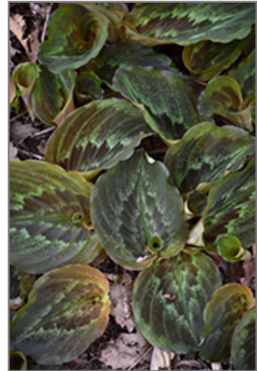
Silver Spot Plant foliage

A shade loving ginger with large, rounded leaves that have three rows of silver spots arranged across them; pattern of spots can be highly variable; purple flowers appear intermittently; an interesting houseplant for low light areas