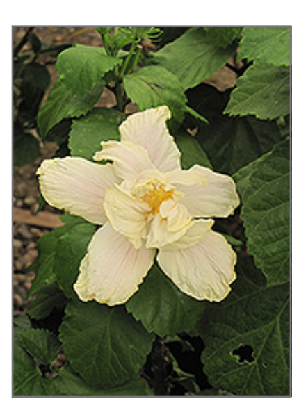
White Kalakaua Hibiscus flowers

When grown indoors, White Kalakaua Hibiscus can be expected to grow to be about 5 feet tall at maturity, with a spread of 4 feet. It grows at a fast rate, and under ideal conditions can be expected to live for approximately 5 years. This houseplant will do well in a location that gets either direct or indirect sunlight, although it will usually require a more brightly-lit environment than what artificial indoor lighting alone can provide. It requires an evenly moist well-drained soil for optimal growth, but will suffer if left to grow in standing water. The surface of the soil shouldn't be allowed to dry out completely, and so you should expect to water this plant once and possibly even twice each week. Be aware that your particular watering schedule may vary depending on its location in the room, the pot size, plant size and other conditions; if in doubt, ask one of our experts in the store for advice. It will benefit from a regular feeding with a general-purpose fertilizer with every second or third watering. It is not particular as to soil pH, but grows best in rich soil. Contact the store for specific recommendations on pre-mixed potting soil for this plant.