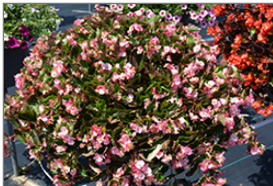
Hula Pink Begonia in bloom

Hula Pink Begonia is a fine choice for the garden, but it is also a good selection for planting in outdoor containers and hanging baskets. Because of its spreading habit of growth, it is ideally suited for use as a 'spiller' in the 'spiller-thriller-filler' container combination; plant it near the edges where it can spill gracefully over the pot. Note that when growing plants in outdoor containers and baskets, they may require more frequent waterings than they would in the yard or garden.