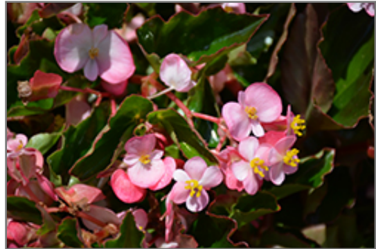
Hula Pink Begonia flowers

Hula Pink Begonia is an herbaceous annual with a ground-hugging habit of growth. Its medium texture blends into the garden, but can always be balanced by a couple of finer or coarser plants for an effective composition.