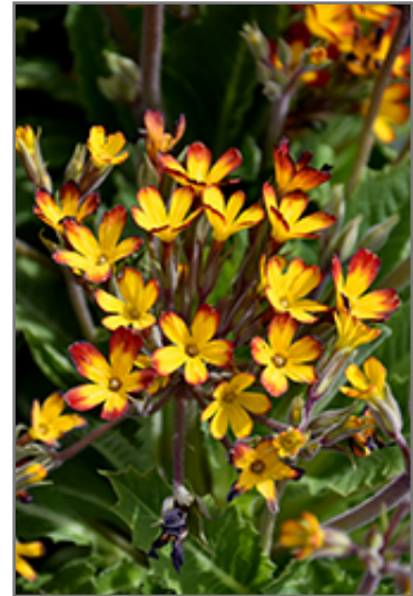
Oakleaf Yellow Picotee Primrose flowers