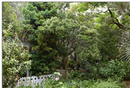
Simpson's Stopper in bloom