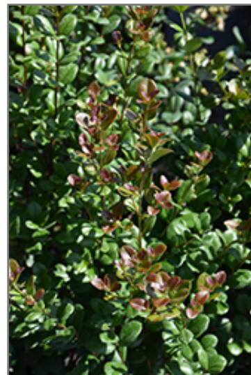
Simpson's Stopper foliage