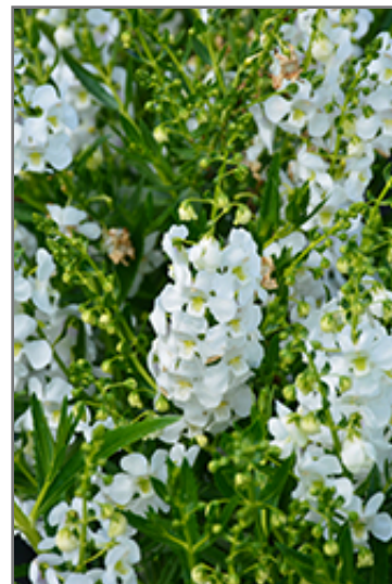
Angelwings White Angelonia flowers

This plant will require occasional maintenance and upkeep, and should not require much pruning, except when necessary, such as to remove dieback. It is a good choice for attracting butterflies to your yard, but is not particularly attractive to deer who tend to leave it alone in favor of tastier treats. It has no significant negative characteristics.