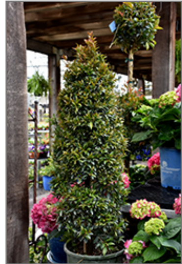
Dwarf Brush Cherry

Dwarf Brush Cherry is recommended for the following landscape applications;