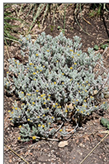
SteppeSuns Hokubetsi