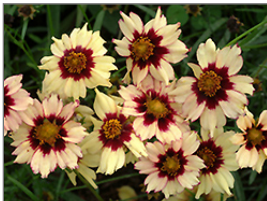
Autumn Blush Tickseed flowers