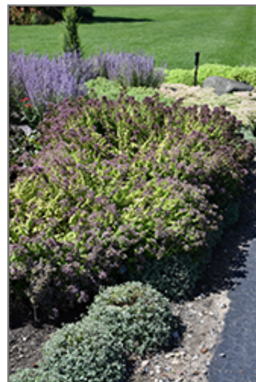
Drops of Jupiter Oregano in bloom