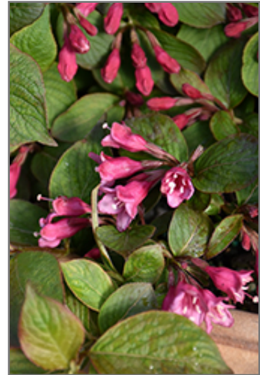
Midnight Sun Reblooming Weigela flowers

Midnight Sun Reblooming Weigela makes a fine choice for the outdoor landscape, but it is also well-suited for use in outdoor pots and containers. It is often used as a 'filler' in the 'spiller-thriller-filler' container combination, providing a mass of flowers and foliage against which the thriller plants stand out. Note that when grown in a container, it may not perform exactly as indicated on the tag - this is to be expected. Also note that when growing plants in outdoor containers and baskets, they may require more frequent waterings than they would in the yard or garden.