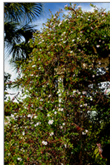
Climbing Aster in bloom