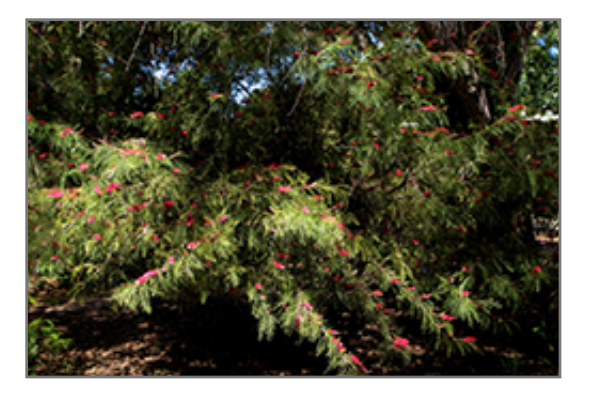
Red Hooks Grevillea in bloom