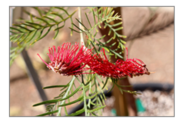
Red Hooks Grevillea flowers

Red Hooks Grevillea is recommended for the following landscape applications;