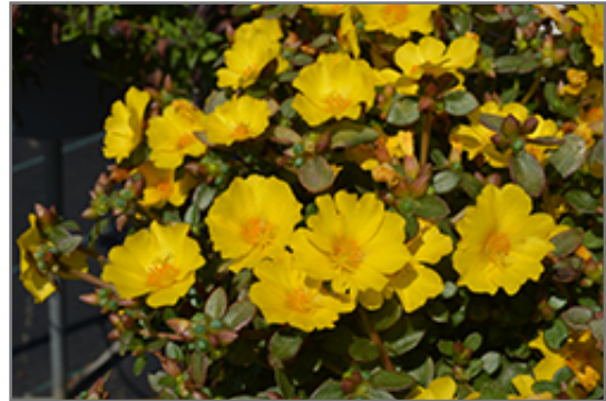
Cupcake Upright Lemon Zest Portulaca flowers

Cupcake Upright Lemon Zest Portulaca is recommended for the following landscape applications;