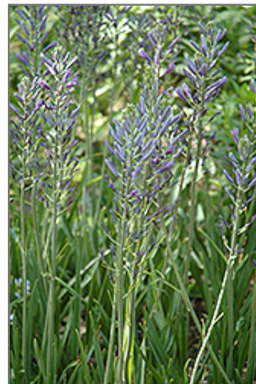
Blue Camassia flowers

Blue Camassia is recommended for the following landscape applications;