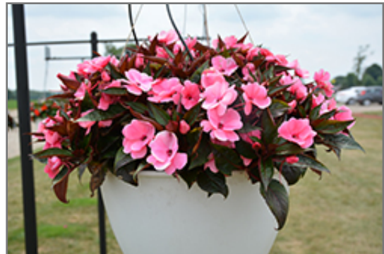
Painted Select Light Pink New Guinea Impatiens in bloom