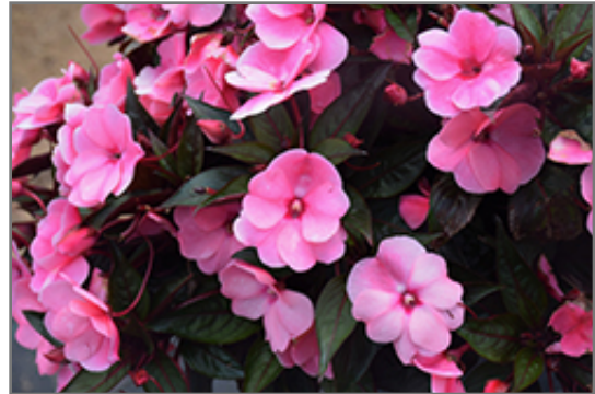
Painted Select Light Pink New Guinea Impatiens flowers

Painted Select Light Pink New Guinea Impatiens is recommended for the following landscape applications;